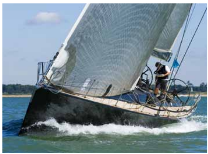
High precision nautical applications