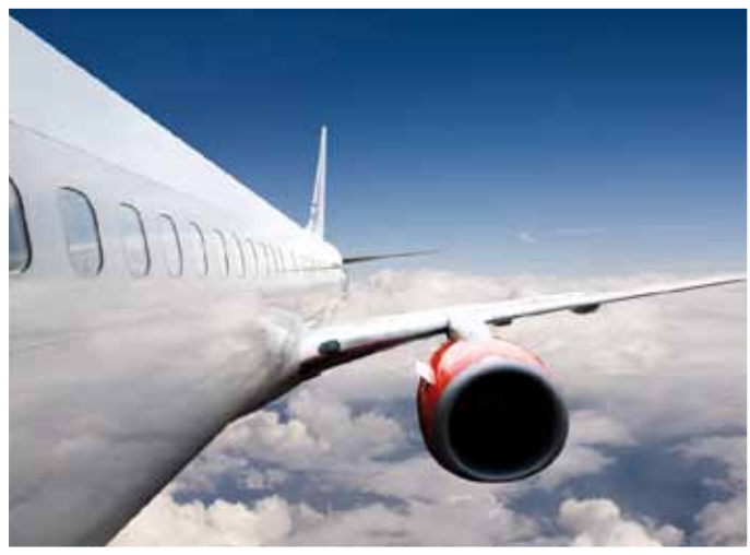
Custom Aerospace applications

Work piece holding flexibility is provided by optional clamping, grid or manifold vacuum systems. The MASS 5 HD has an industry standard G-code platform that allows easy interface with all major CAD/CAM software packages. Additional options include work piece dimension probing, both single and multiple zone capabilities and custom configurations upon request.