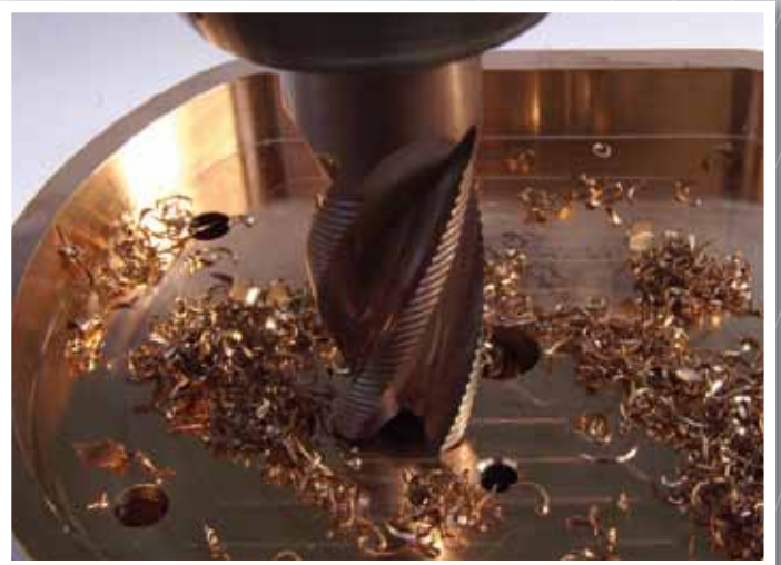
Custom applications for military, satellite and medical industries.